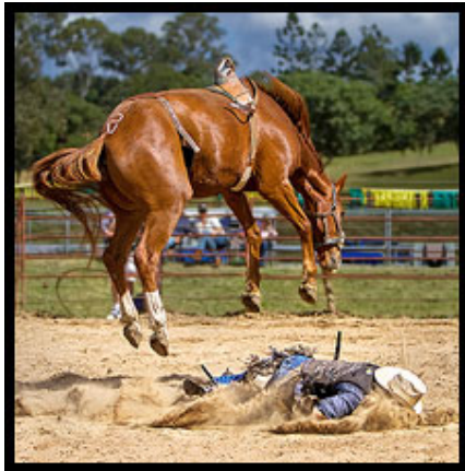
Photo: Horse 1, Rider 0